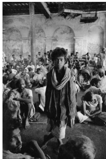
12_ Frank Horvat, Beggar assembly, Calcutta, India, 1962